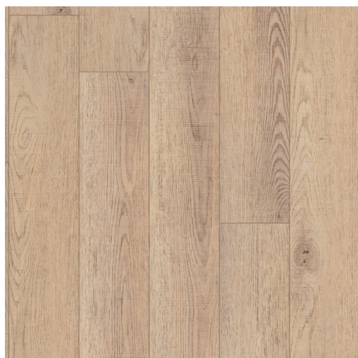
CHARTREUSE · UV582-00109