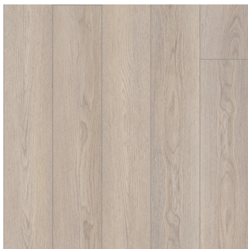
CITRON · UV582-00111

with COREtec® technology is designed to MAXimize your style! These beautiful, long-plank wood decors are engineered with patented COREtec® 100% waterproof composite core that is extremely dense and stable — it will not contract or expand! Even better, FUSION Enhanced-MAX resists spills of any kind, making the cleaning and everyday maintenance plain and simple.