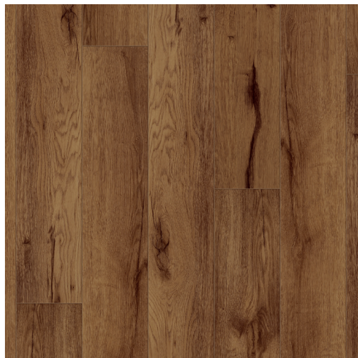
CHAMBORD · UV582-00102