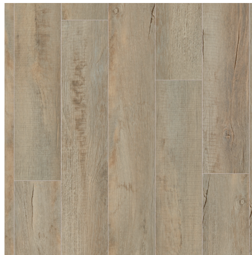
MUROL · UV582-00108