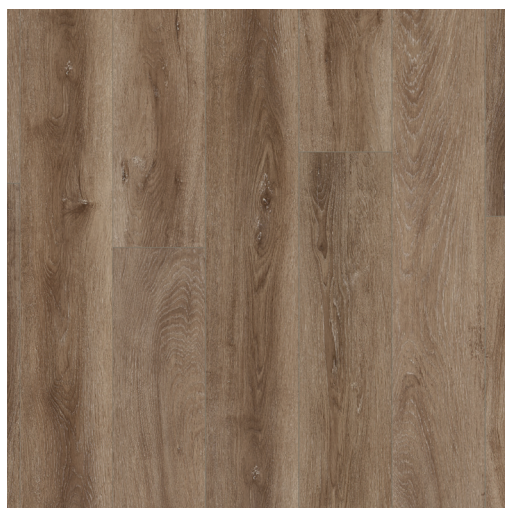
BENEDICTINE · UV582-00110